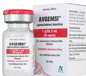
1 g/26.3 mL NDC: 83831-0123-01

To order AVGEMSI™ (gemcitabine) injection, please contact one of these authorized specialty distributors and use the appropriate order number: