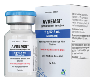
2 g/52.6 mL NDC: 83831-0124-01